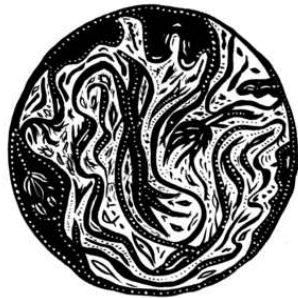
Universal Dance Mandala